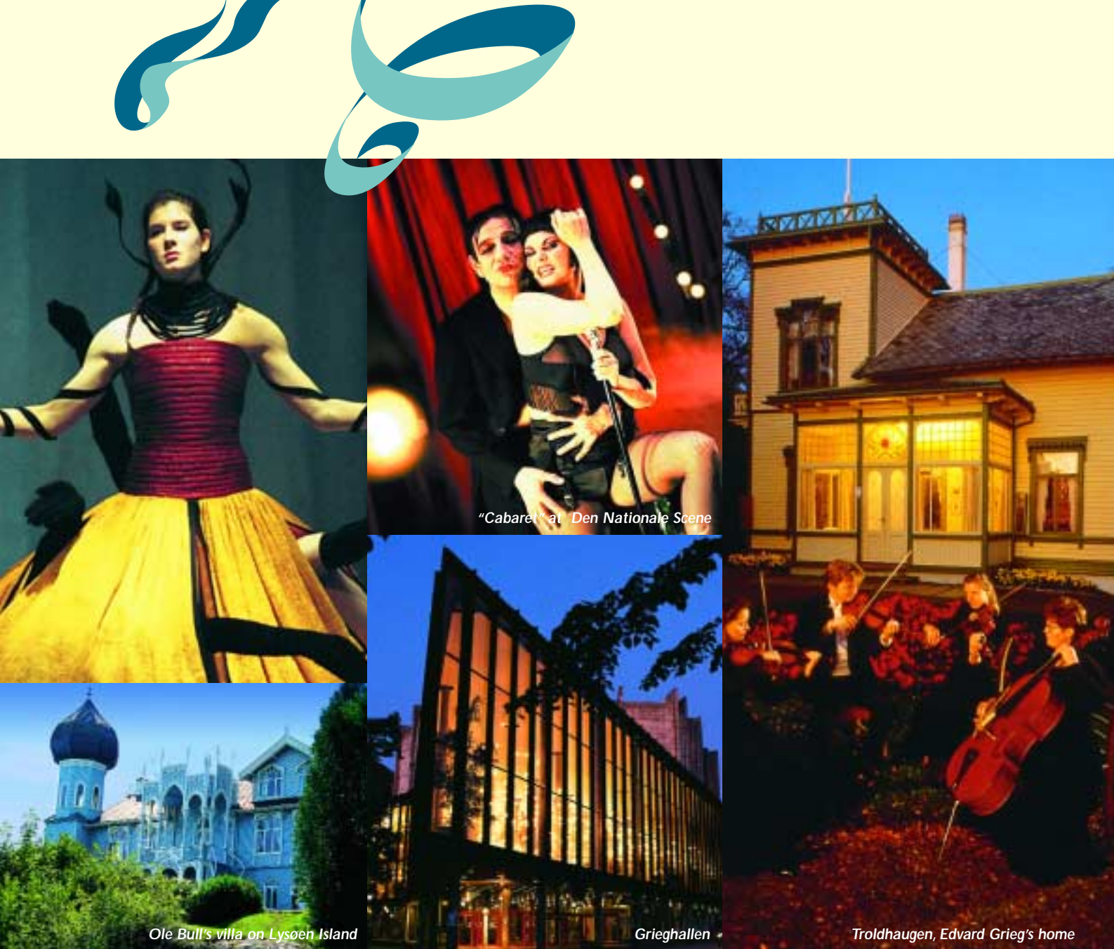
"Cabaret" at Den Nationale Scene