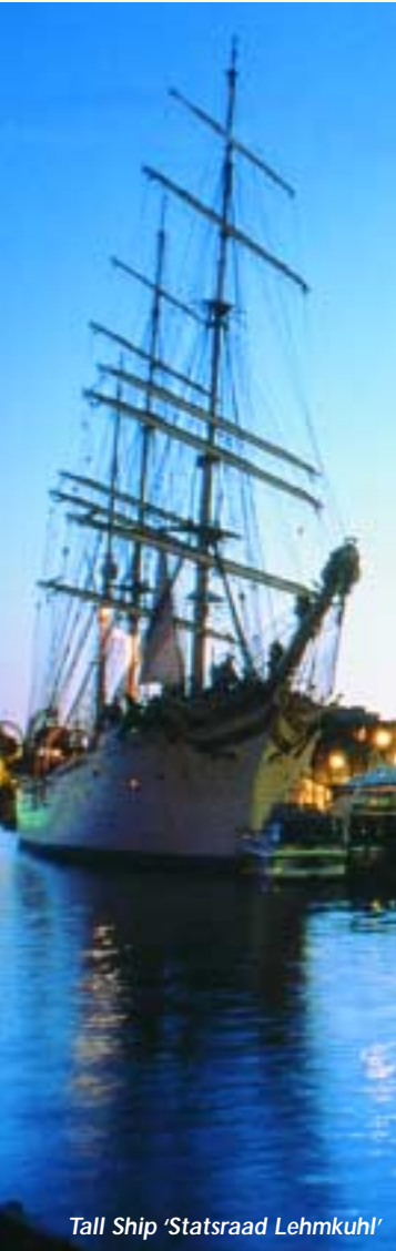
Tall Ship 'Statsraad Lehmkuhl'