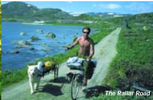
The Rallar Road