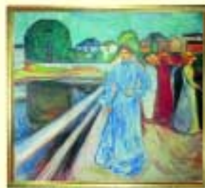
Edvard Munch: The Quay 1903, Bergen Art Museum

Aside from their commercial interests, Bergen merchants had a nose for culture. It was they who laid the foundations for Bergen to be the cultural city it is today. Bergen has