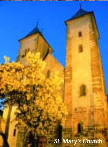
St. Mary's Church