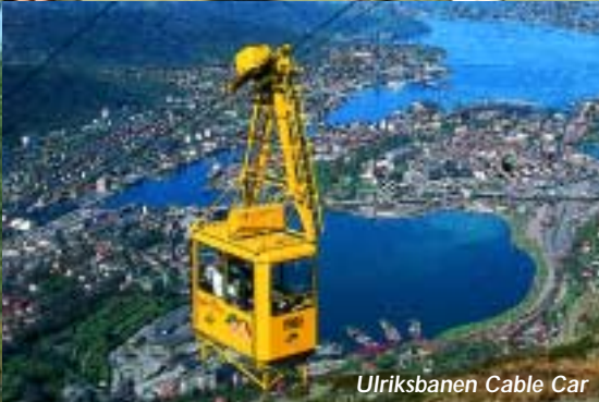
Ulriksbanen Cable Car