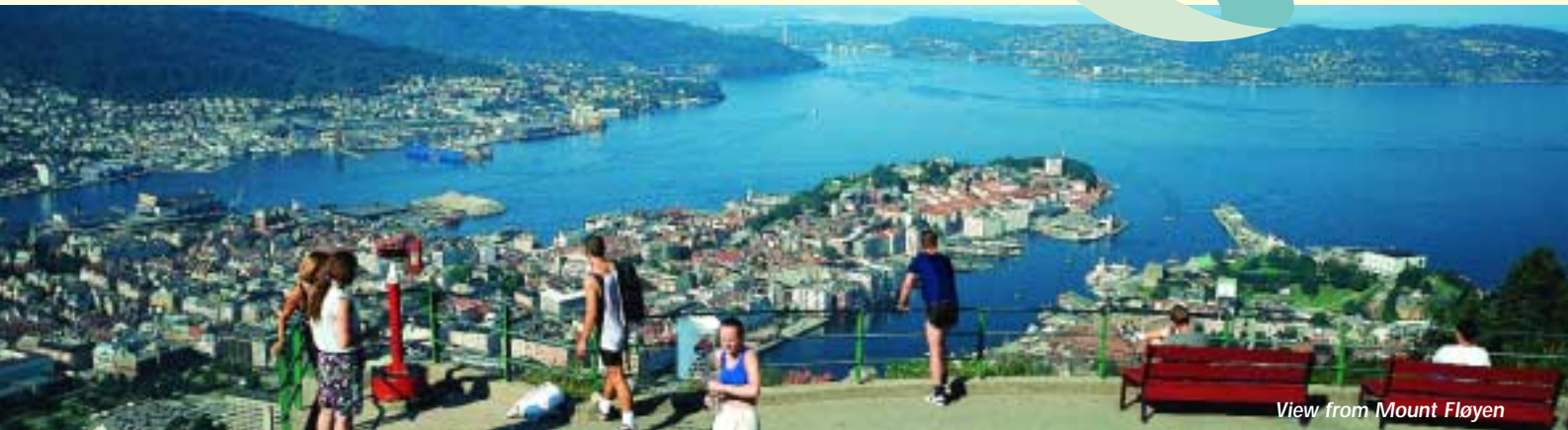
View from Mount Fløyen