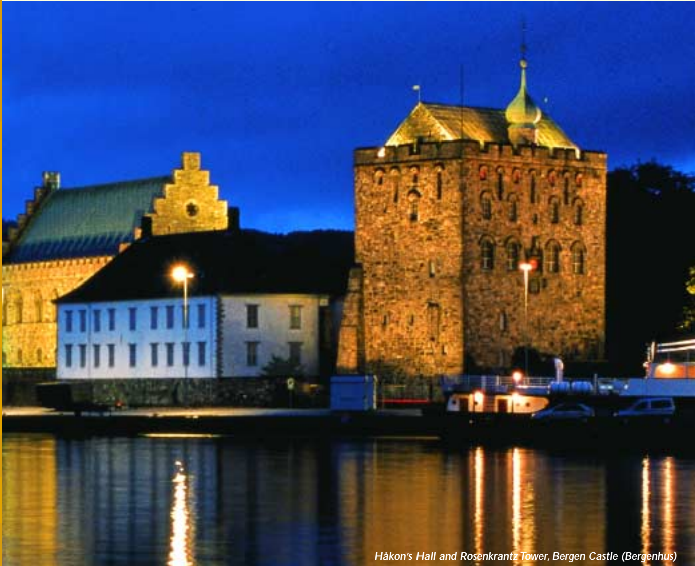
Håkon's Hall and Rosenkrantz Tower, Bergen Castle (Bergenshus)

Bergen has given a warm welcome to its visitors for more than 900 years