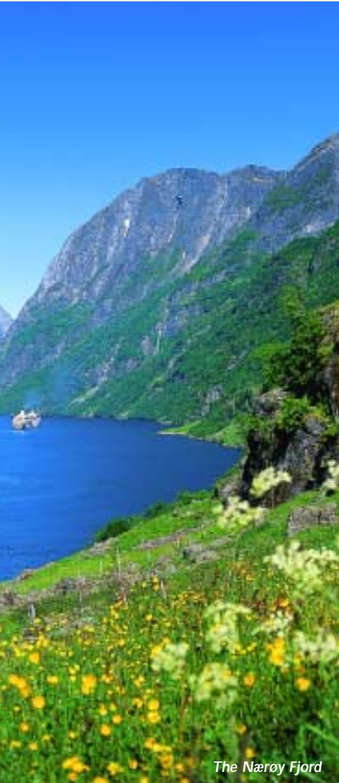
The Nærøy Fjord