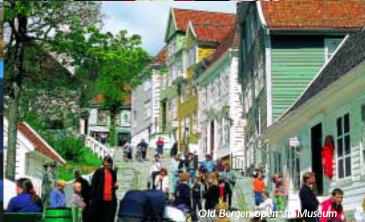
Old Bergen open air Museum

Come to Bergen in the summer when the land is lush in every shade of green; when the fjords are abuzz with small boats, and the city is alive with visitors.