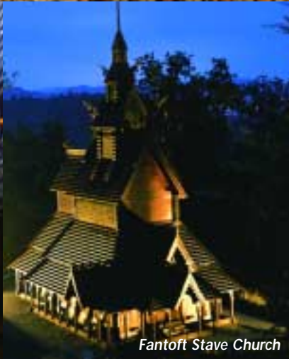
Fantoft Stave Church