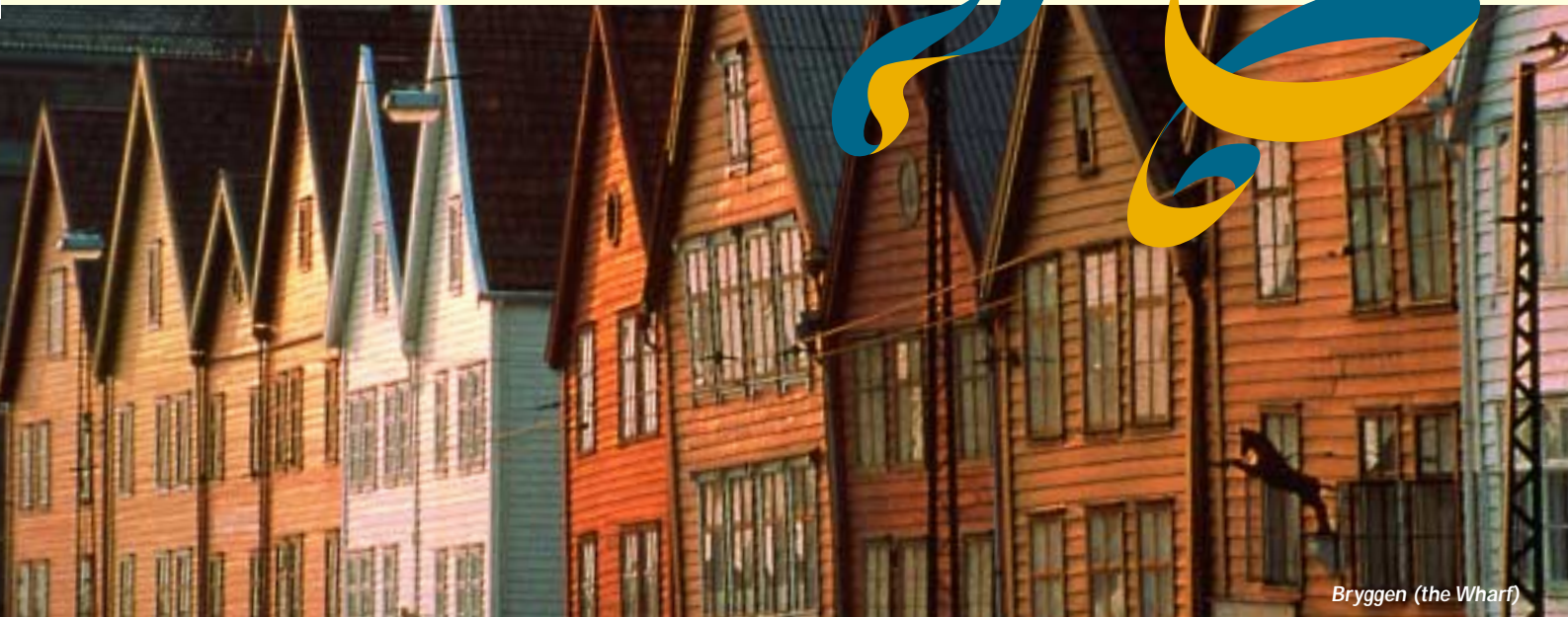
Bryggen (the Wharf)