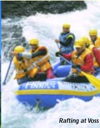
Rafting at Voss