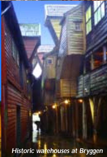
Historic warehouses at Bryggen