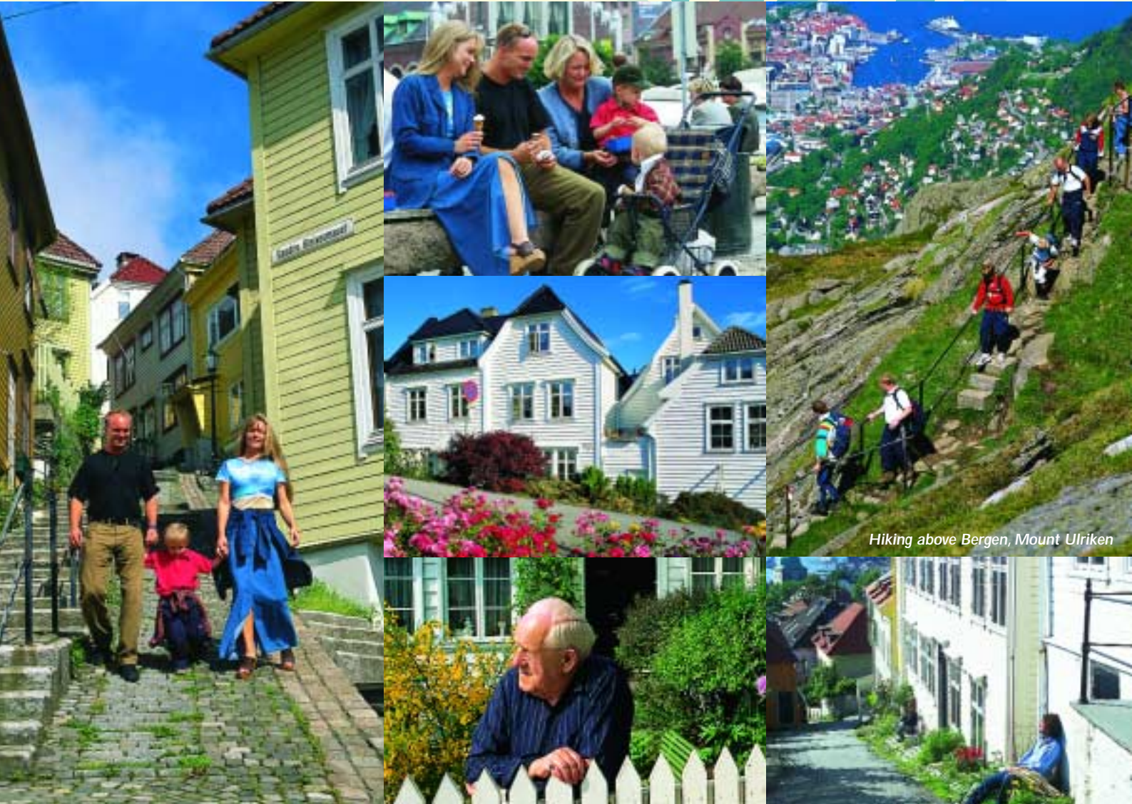
Hiking above Bergen, Mount Ulriken

Clusters of old houses cling together in among the new quarters. Bergengers take a keen interest in protecting their grass-root traditions and building styles, and Bergen architecture is distinctive yet diverse. Though Bergen has suffered many fires over the centuries, it still has one of Europe's largest conglomerates of wooden houses. Not to say the largest.