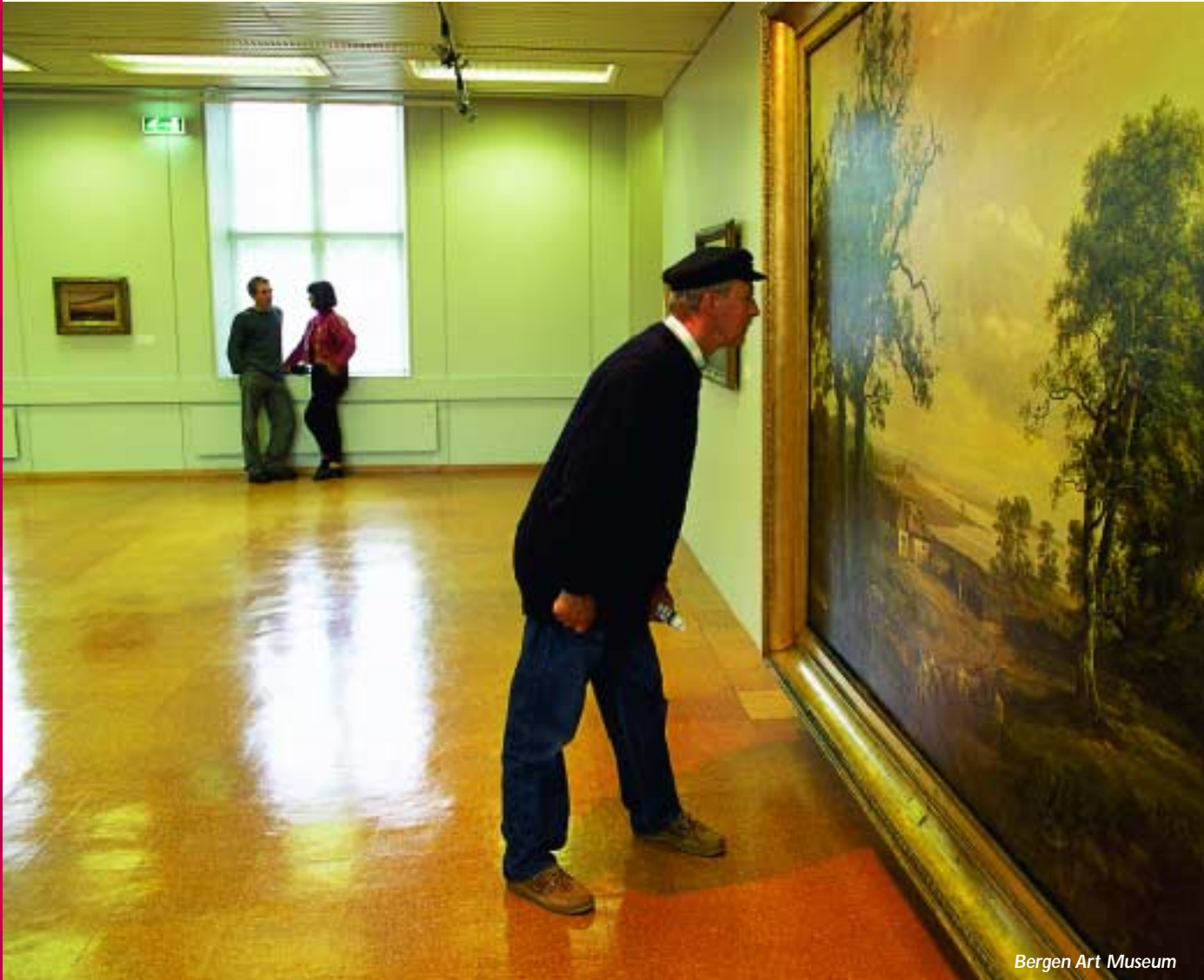
Bergen Art Museum